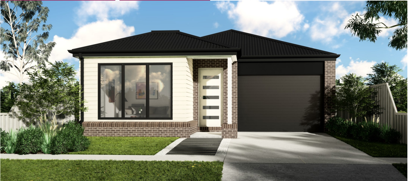
Image & façade shown for illustrative purposes