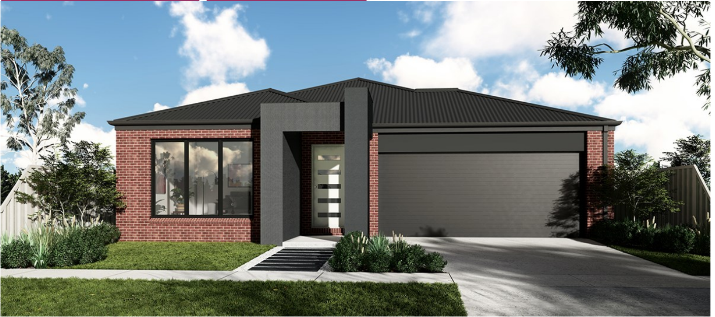
Image & façade shown for illustrative purposes