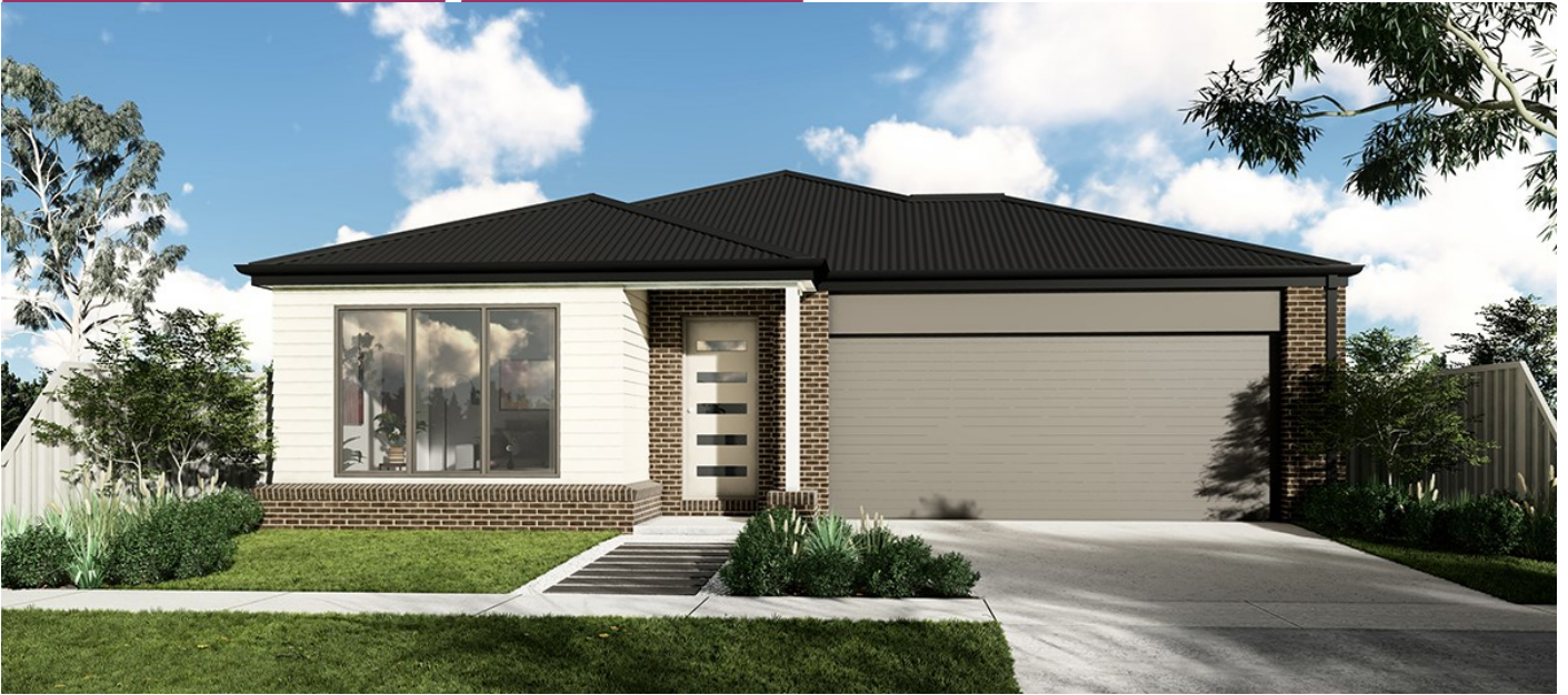
Image & façade shown for illustrative purposes