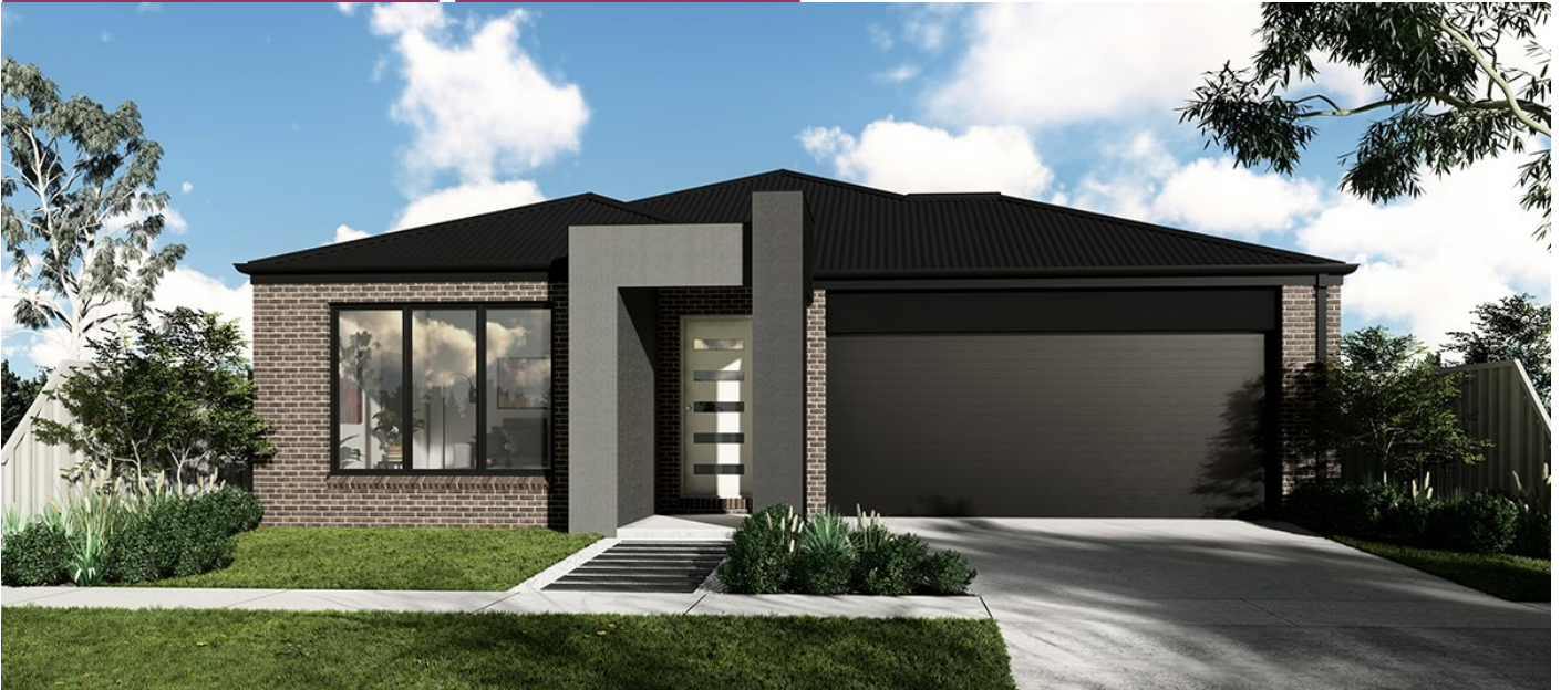
Image & façade shown for illustrative purposes