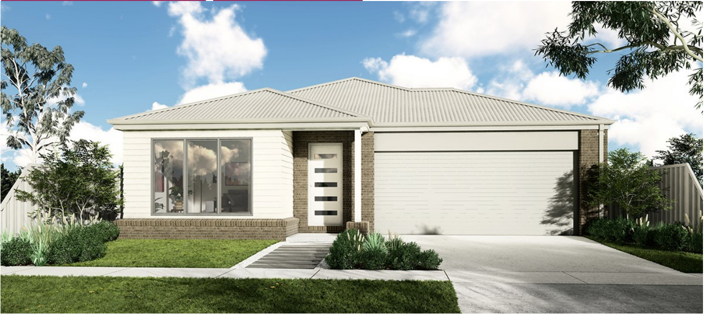
Image & façade shown for illustrative purposes