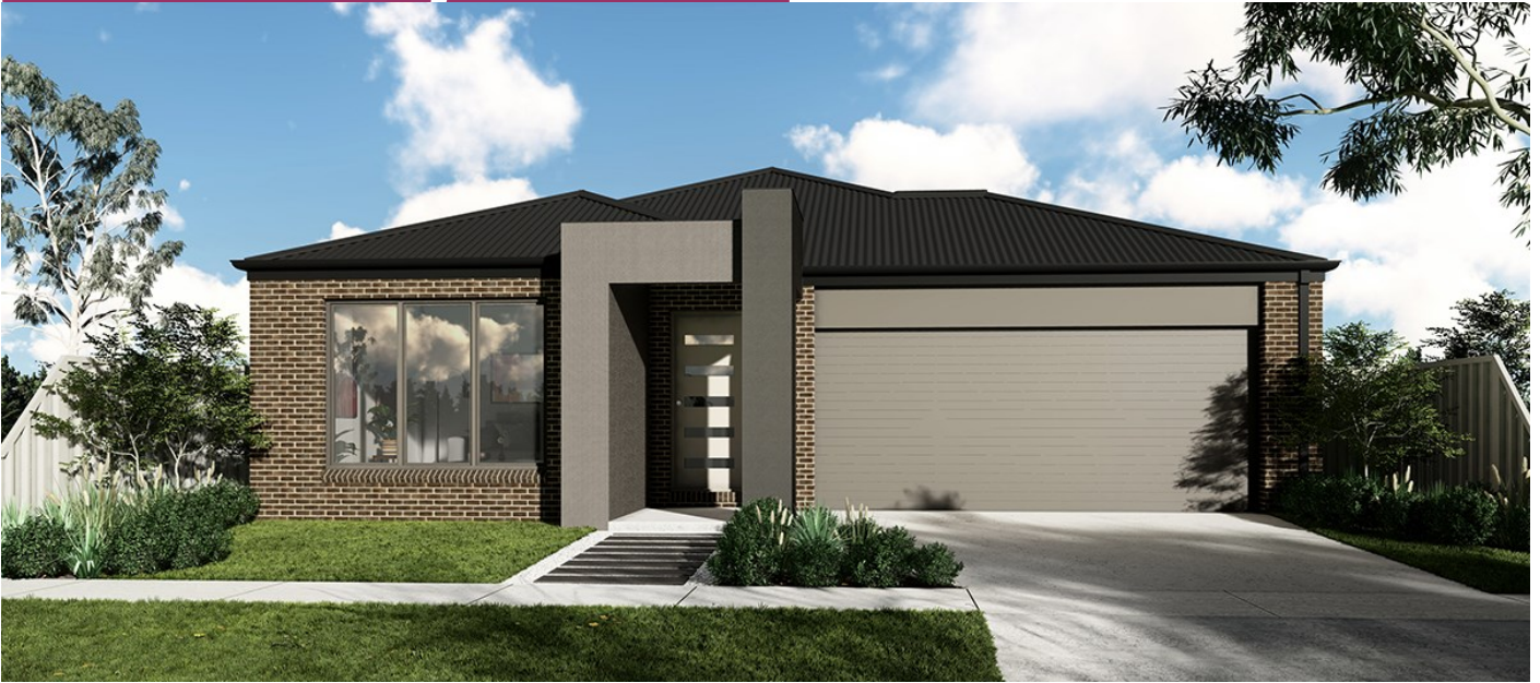
Image & façade shown for illustrative purposes