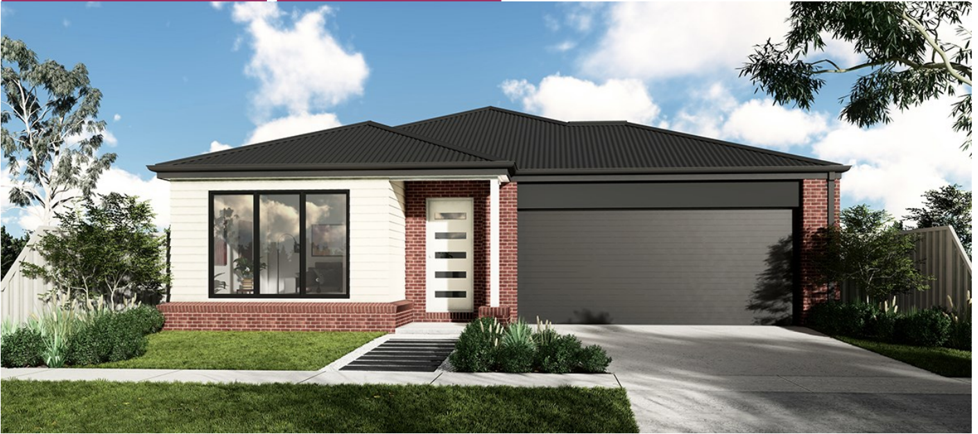
Image & façade shown for illustrative purposes